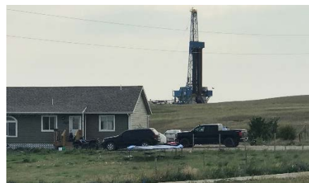
Negotiating with pipeline company and drilling operations requires skills. Do you have them?