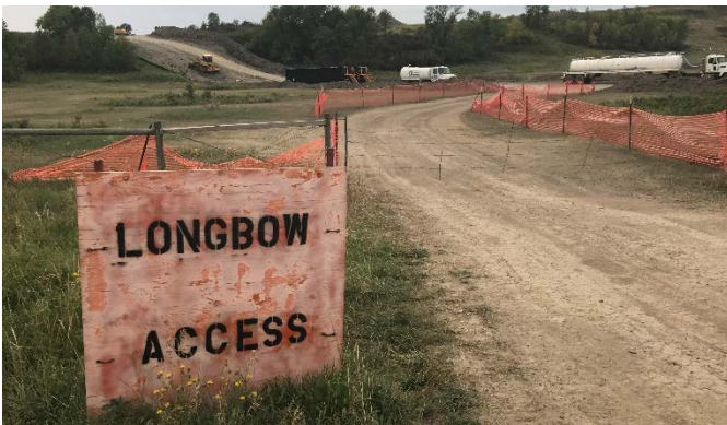
What do you do when a corporation wants to access your land?