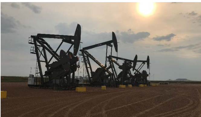
Pump jacks in the Four Bears Segment on Fort Berthold Reservation.